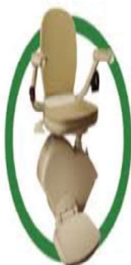
Stair Lifts & Bath Lifts