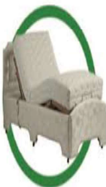
Custom Made Adjustable Beds