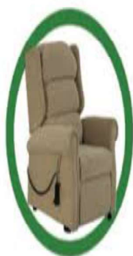
Rise & Recline Chairs