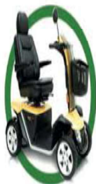
Scooters & Wheelchairs