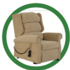
Rise & Recline Chairs