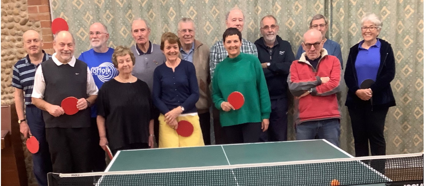
The competitors . . . before battle commenced

The inaugural David Buckley Cup singles tournament took place on Friday 24 November 2023.