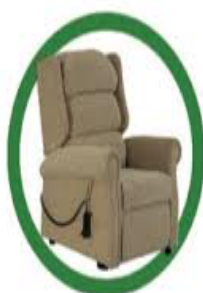
Rise & Recline Chairs