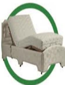
Custom Made Adjustable Beds