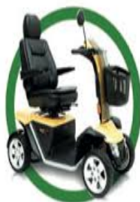
Scooters & Wheelchairs