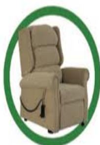
Rise & Recline Chairs